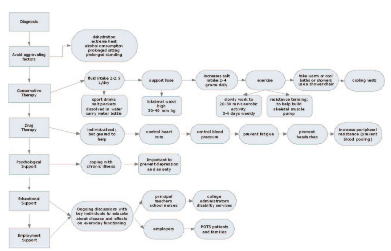
Figure. Treatment strategies for POTS.