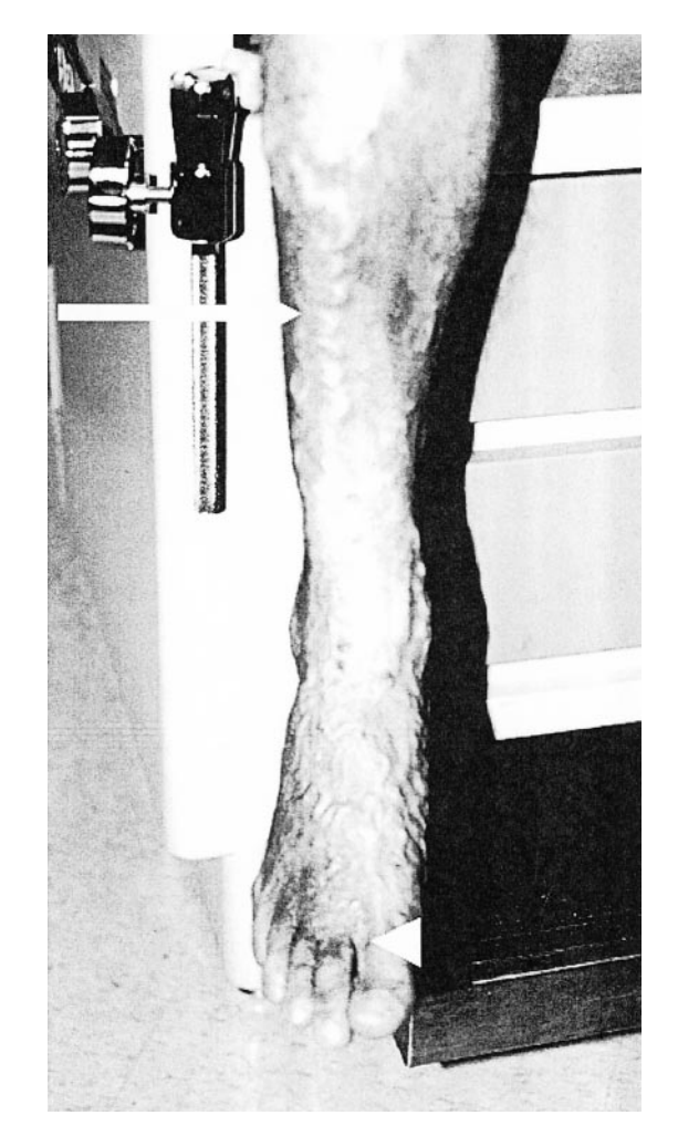
Figure 1. Varicose veins. This photo shows a case of severe varicose veins. The long arrow points to a meandering, snake-like, large varicose vein in the front of the calf. The arrowhead indicates an area of inflammation (redness, warmth) where episodes of bleeding have occurred.

Although most patients see a physician for the poor cosmetic appearance of varicose veins, they can also experience symptoms of burning, aching, or itchiness. Symptoms tend to be less severe in the morning after a night of leg elevation in bed and worsen through the day with standing. Occasionally, without proper care, varicose veins may