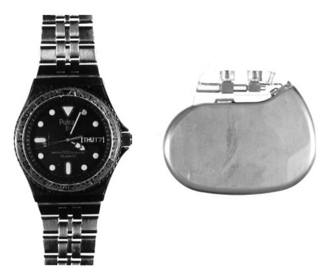
Figure 1. A modern pacemaker.

patients carry an identification card that provides specific information on the type of leads and pacemaker implanted (Figure 3). Such a card can be shown to healthcare professionals during medical evaluations and to security personnel at airports.